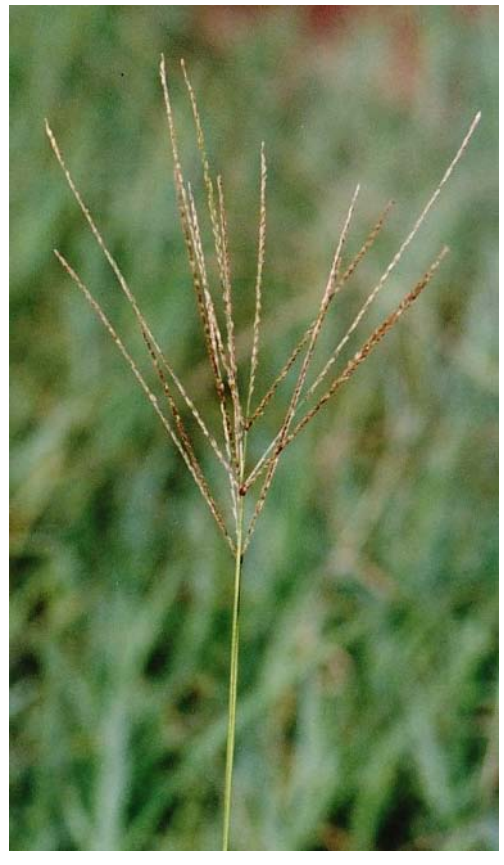
Figure 1. Jarra finger grass seed head

Strickland is less hairy than Jarra and is blue-green in appearance. During the wet season, it produces runners up to 2.5 m long, foliage up to 70 cm high and flowering stems up to 1.3 m tall. Its average stem thickness and leaf width are smaller than those of Jarra. See Agnote 740 (E65) Strickland Finger Grass .