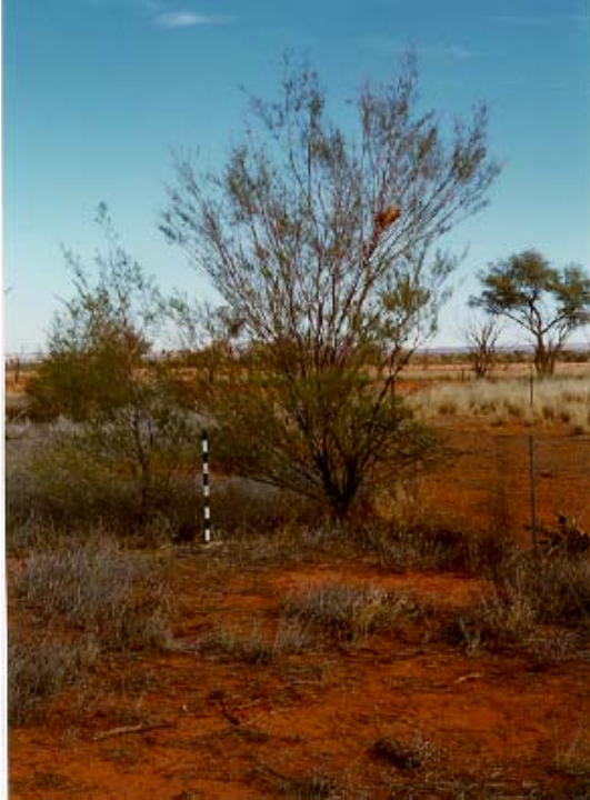
Figure 1. Photograph of a juvenile Acacia aneura (Mulga) tree in calcareous shrubby grassland. With an average growth rate of 16 cm per annum this tree is estimated to be approximately 20 years old.