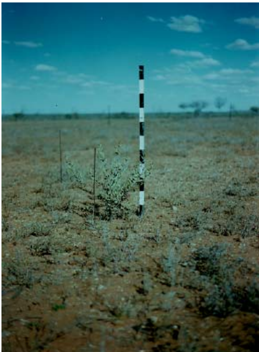
Figure 3. Photograph of a juvenile Acacia kempeana (Witchetty Bush) shrub in calcareous shrubby grassland. With an average growth rate of 5 cm per annum, this shrub is estimated to be approximately 13 years old.