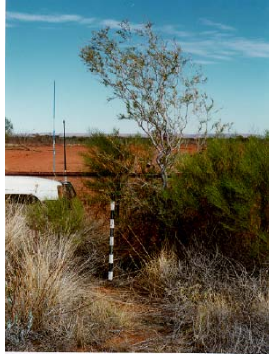
Figure 2. Photograph of a juvenile Acacia estrophiolata (Ironwood) tree in calcareous shrubby grassland. With an average growth rate 29 cm per annum, this tree is estimated to be approximately 12 years old.