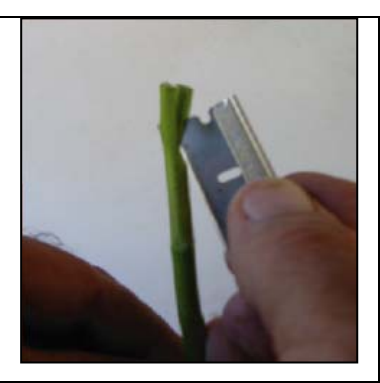
Step 2: Cut off the rootstock at a height where it is the same thickness as the tomato. Remove leaves and split down the centre of the rootstock stem to a depth of about 15 mm.