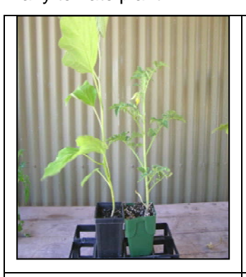
Step 1: Sow wild malay eggplant rootstock into pots 2 - 3 weeks earlier than the tomatoes as tomatoes grow faster.

By grafting onto any resistant solonaceae rootstock, tomatoes can be produced in an area infested with bacterial wilt. The most commonly used resistance solonaceae rootstock is Wild Malay Eggplant. Contact DRDPIFR regarding suppliers of Wild Malay Eggplant seeds. It must be remembered however that the grafted part is still subject to all the insect pests and diseases which normally attack the leaves, stems, fruit and growing points of any tomato plant.