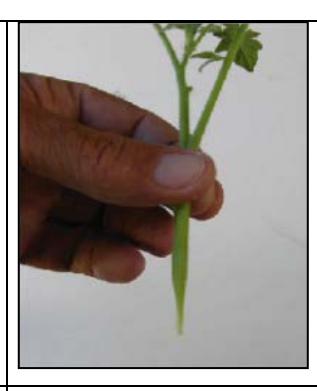
Step 4: Cut a wedge shape in the tomato by cutting down each side.