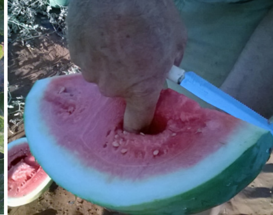
Watermelon flesh breakdown