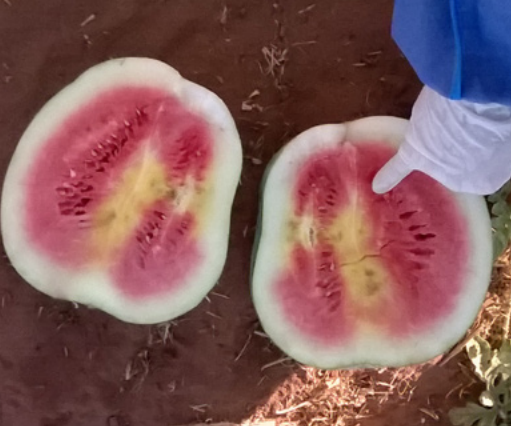
CGMMV watermelon fruit yellowing