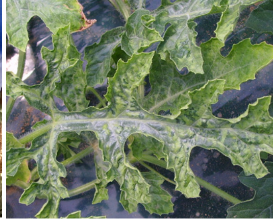
CGMMV watermelon leaf mottling