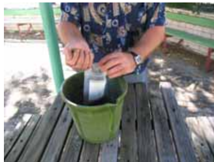
Figure 5. Mix and take a "grab" sample of soil