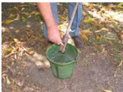
Figure 4. Collect samples in plastic bucket

Up to 10 samples are collected from an orchard, depending on how large the area is. These are collected across the orchard taking a diagonal line from corner to corner, so as to cover the whole area evenly. The samples are placed in a plastic bucket (see Figure 4) and mixed together. From this a total volume of 200-300 mL is taken (see Figure 5) and placed in a clean plastic bag which is labelled with the orchard name or number for identification.