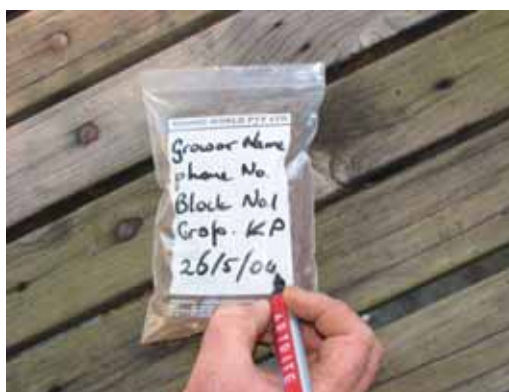
Figure 6. Clearly label the sample and send for analysis