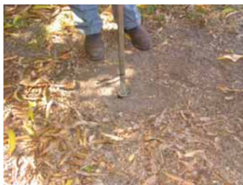
Figure 3. Remove the leaf litter and any fertiliser