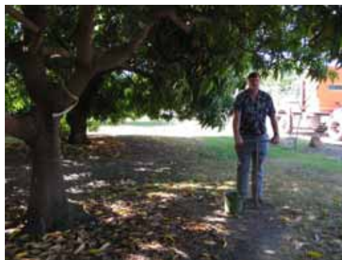
Figure 2. Collect soil samples from inside the drip line

Ensure tools used are clean or contamination of the sample may result. Do not use galvanised implements. A clean plastic bucket should be used for holding the soil samples. Each sample is taken from the surface to a depth of 15–20 cm, and should contain soil from the whole profile. The easiest method is with a soil auger. If a soil auger is not available dig a hole