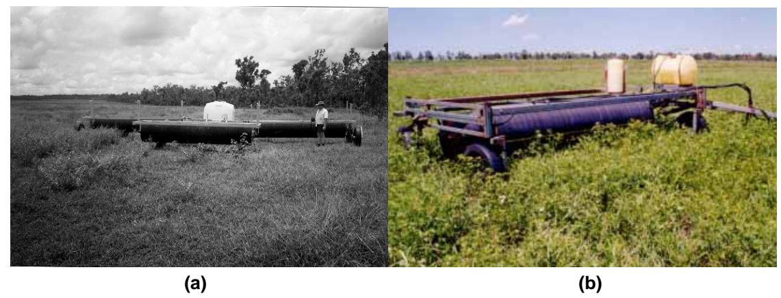
Figure 1. Carpet rollers – (a) multiple and (b) single roller designs

Herbicide carpet rollers (see Figure 1) are simple and relatively cheap machines for wiping tall erect weeds above the crop or pasture, without applying herbicide to the desired plants. This type of machine has been found to be effective for the control of many of the Top End's broadleaf, woody and taller grass weed species.