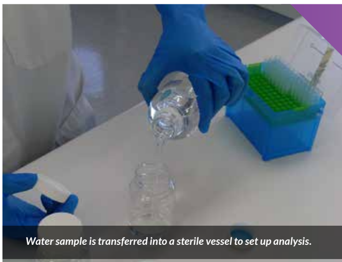
Water sample is transferred into a sterile vessel to set up analysis.