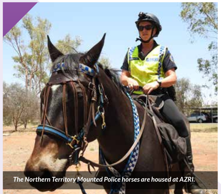
The Northern Territory Mounted Police horses are housed at AZRI.

The history of the Mounted Police in Alice Springs dates back to 1870. Eligible horses are selected, trained and placed on patrol with police officers. The Northern Territory Mounted Police patrol the Alice Springs township and surrounding communities, and have been highly successful due to the elevation and the mobility of the police officers. They support operational duties and enhance engagement with the general public. They are housed at AZRI.