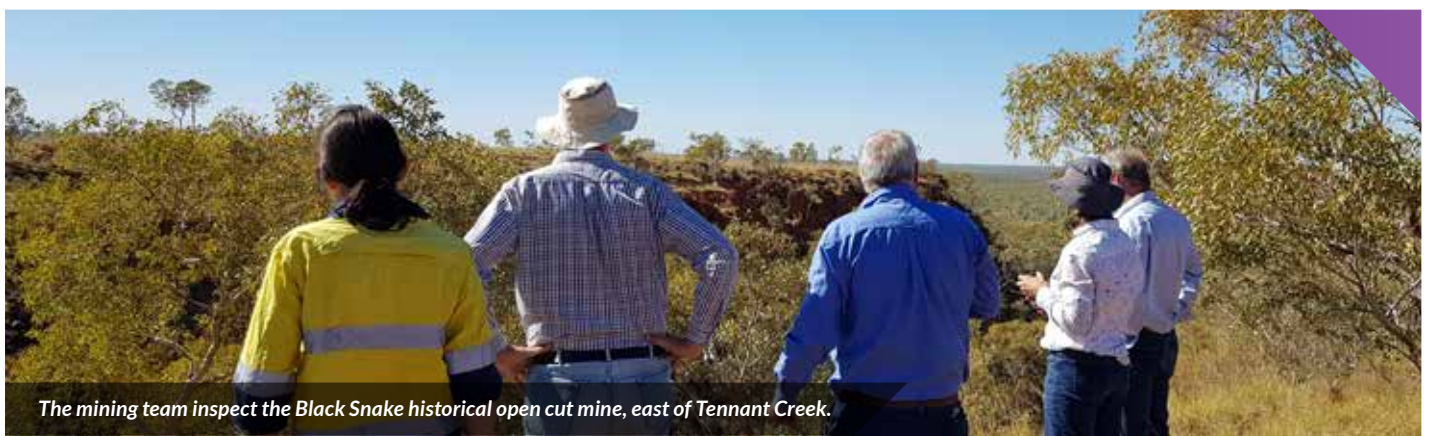
The mining team inspect the Black Snake historical open cut mine, east of Tennant Creek.