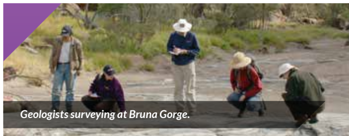
Geologists surveying at Bruna Gorge.

Mining Operations regulates environmental management of mining, extractive and exploration operations, in accordance with the Mining Management Act . The Mining Operations Central Mining team assesses mining management plans, and monitors, inspects and audits mining operations within Central Australia, including the Tanami and Tennant Creek regions.