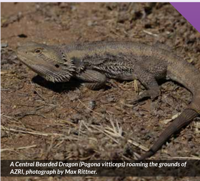
A Central Bearded Dragon (Pogona vitticeps) roaming the grounds of AZRI.

Oversees the management of the parks, reserves, heritage assets and wildlife in Central Australia. A key role of the division is to protect and provide sustainable access to the Territory's natural and cultural estates. Its regional office is in the Tom Hare building.