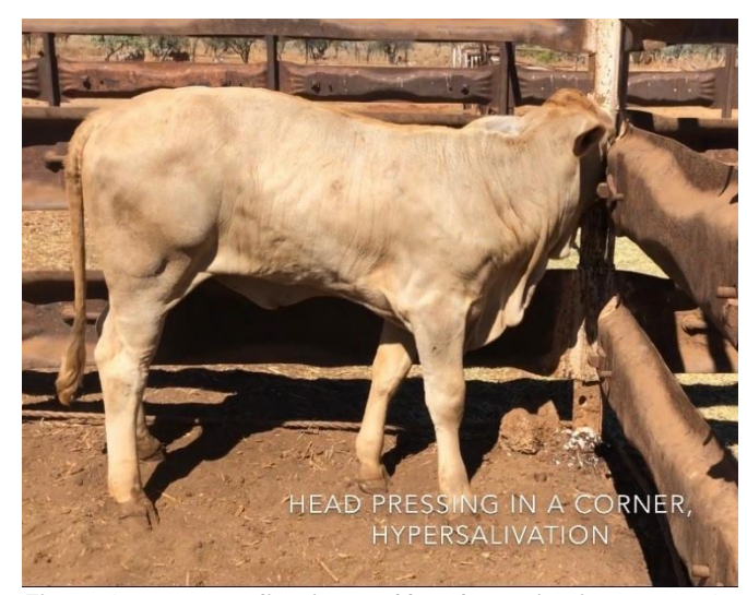
Figure 3: weaner salivating and head pressing in corner of yards