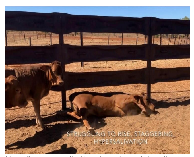
Figure 2: weaners salivating, staggering and struggling to rise

A presumptive diagnosis was made within 24 hours of investigation. The station manager was advised to limit the amount of high quality hay given to the weaners, slowly increasing the volume, to allow the rumen microflora to adapt to the change in feed. By day 5, no further cases had occurred and mildly affected animals were returning to normal without requiring medical intervention. The veterinary officer also explained to the manager that if the same conditions were to occur again, the effects of a sudden feed quality and quantity change can be mitigated with the use of injectable Vitamin B complex for a few days after weaning. However, this may be a cost-prohibitive option when dealing with large mobs. Alternatively, close observation of the mob and injecting affected animals with Vitamin B1 early in the disease course, may lead to a remission of clinical signs within 6-24 hours. A total of 15 animals died or were humanely destroyed; morbidity was approximately three per cent and mortality less than two per cent. Cases have been reported elsewhere of losses up to 10%.