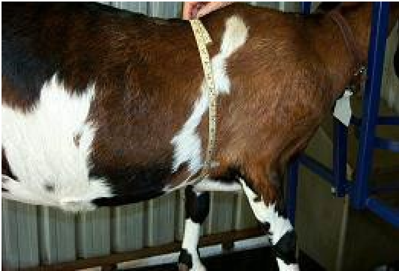
Table 1. Estimating goat weights from girth measurements