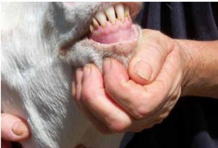
Figure 1: Healthy gums

Goats with high worm burdens may have gums that are white or grey-blue in colour. 'Bottle jaw' (swelling under the jaw), caused by low protein in the circulation, may also develop in severe cases of Barber's pole worm infestation in goats.