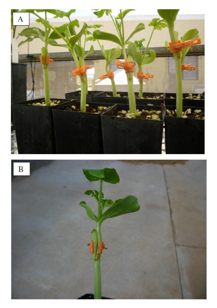
Fig. 2. A successful side insertion graft (A, B) from the preliminary grafting trial.