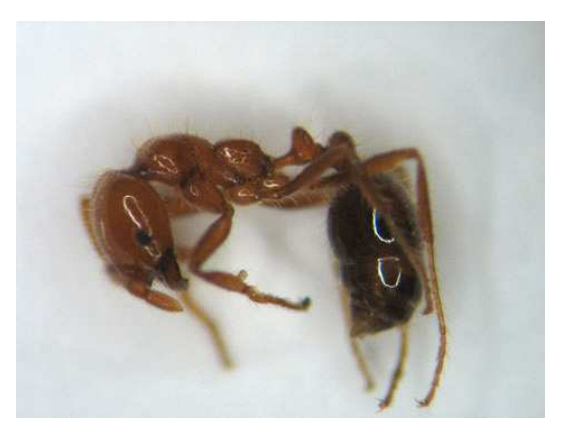
Solenopsis geminata (minor worker)

Please visit us on our website at www.entomology.nt.gov.au