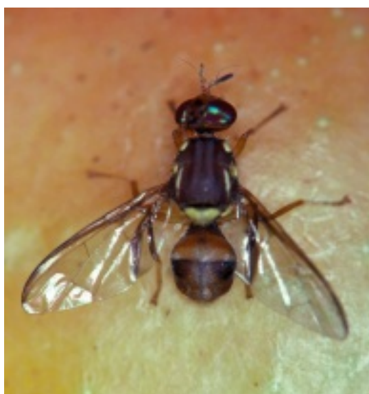
Figure 1. Bactrocera tryoni

Fruit flies are major pests of horticultural crops throughout the world and many species occur in Australia. Many fruit fly species have been recorded in the Northern Territory (NT). However, only two, Bactrocera tryoni and Bactrocera jarvisi have attained major pest status.