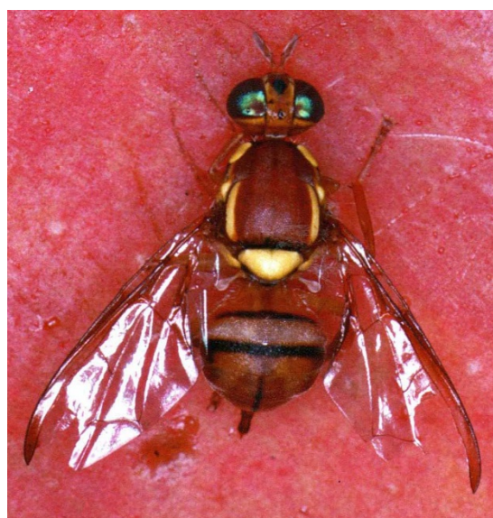
Figure 2. Bactrocera jarvisi