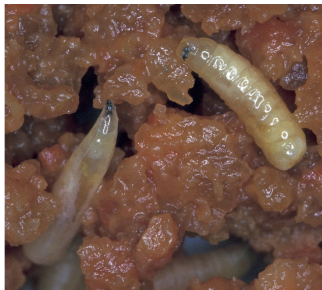
Figure 4. B. tryoni larvae