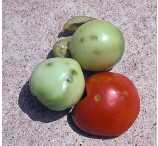
Figure 6. Oviposition damage to tomato fruit