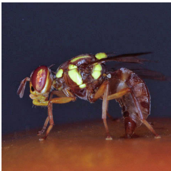
Figure 3. B. tryoni ovipositing into mango fruit

Female flies deposit a clump of six to ten creamy white eggs about 1 mm in length just beneath the skin of ripening fruit but they are rarely seen. After a day or two, the eggs hatch to produce larvae, which burrow into the fruit. Within six to eight days, the legless larvae look like typical maggots, about 8 mm long and creamy white in colour with black markings, especially at the front end. When mature, larvae can move by curling over and flicking open to produce a considerable jump and they leave the fruit to burrow 2-3 cm below the soil surface. Here they pupate into brown barrel-shaped pupae about 5 mm in length. After 10 to 12 days, adult flies emerge from the pupal cases and wriggle their way to the soil surface. Flies become sexually mature after a further two weeks and after mating, females fly in search of ripening fruit. In the Top End, the life cycle is about four to five weeks. However, it is generally longer during the cooler weather experienced in the Alice Springs area in spring and autumn.