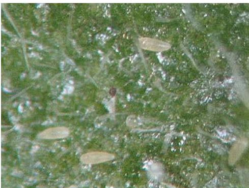
Tomato russet mites