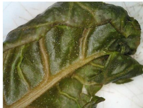
Broad mite damage to silverbeet

The family Tarsonemidae is composed of small terrestrial mites. They have a greater variety of feeding habits than other mite groups. Some of them feed on fungi, algae or other mites, and some feed on green plants, such as the broad mite, Polyphagotarsonemus latus which has a large range of hosts. Broad mite is a major horticultural pest, and has been recorded as a pest of chillies, capsicum, tomato, eggplant, silverbeet, mango and gerbera in the Northern Territory.