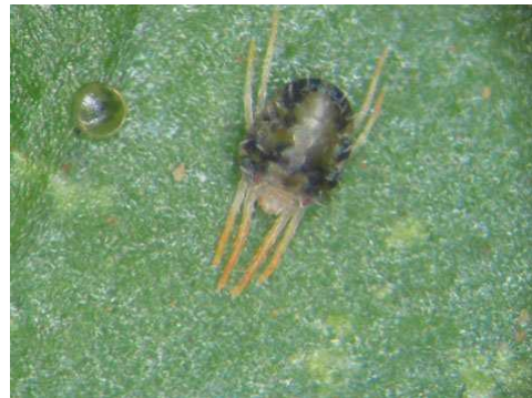
Oriental red mite