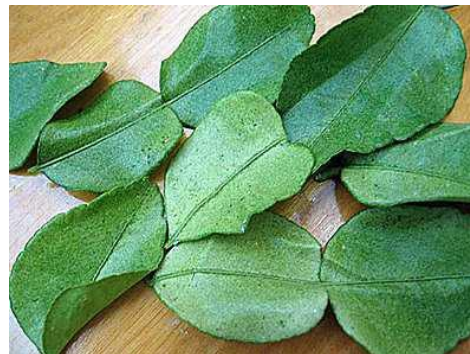
Oriental red mite damage to Kaffir lime leaves

This group of mites are virulent plant pests causing extensive chlorosis, necrosis, defoliation and, often, death of the hosts. Generation times are short in the tropics (about one week) and populations rapidly reach damaging levels. Spider mites migrate on the wind and readily colonise new plants.