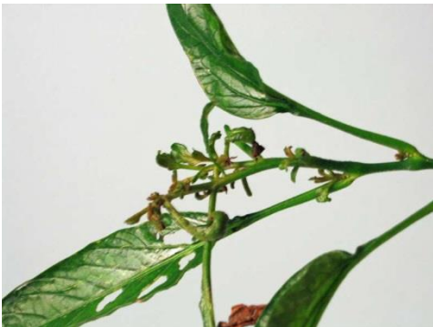
Broad mite damage to chilli leaves