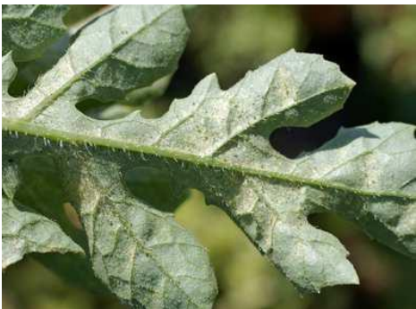
Spider mite damage to eggplant leaves