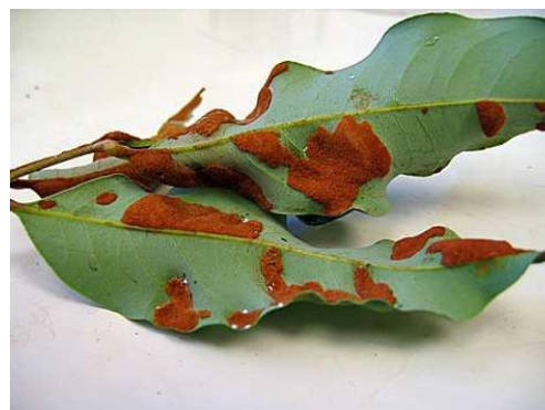
Litchi erinose mite cause erinea on litchi leaf

Rust mites are a large group of highly specialised plant-feeders. They are also known as gall, blister, bud or erinose mites. They are different to the other mites as rust mites only have two pairs of legs and are minute in size. There are over 3030 species described world-wide, however, 15 pest species have been recorded in the Northern Territory from hosts such as tomato, litchi, mango, citrus, Hibiscus and Acacia .