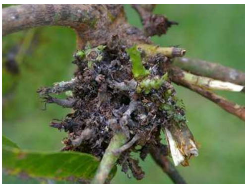
Mango bud mites cause mango bud distortion