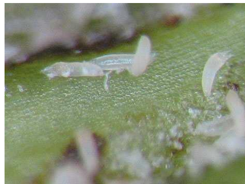
Mango bud mites